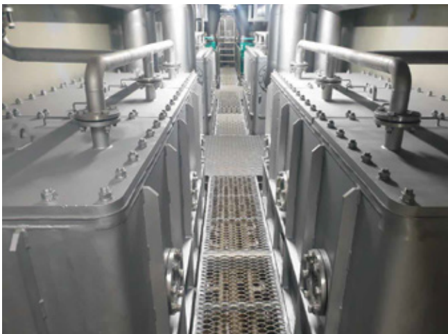
Installation example - Turtle Island, South Korea